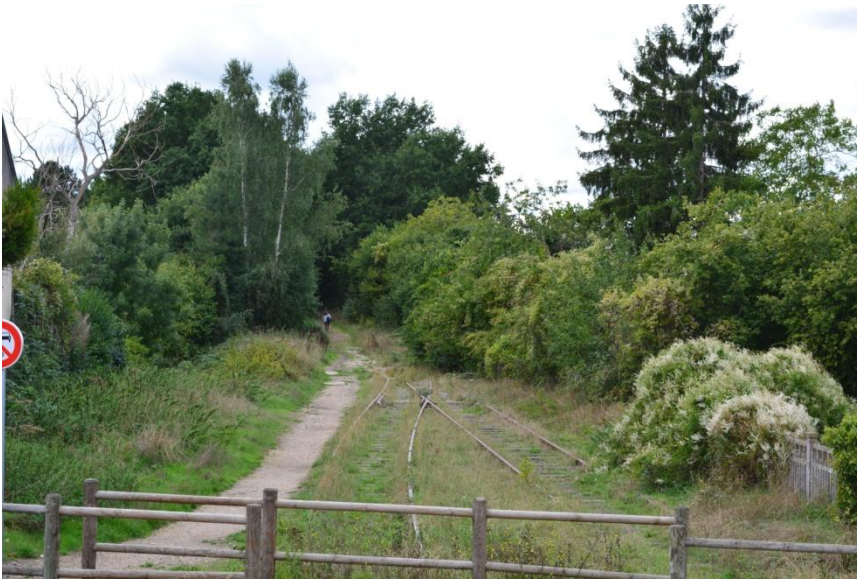
Ancienne voie ferrée