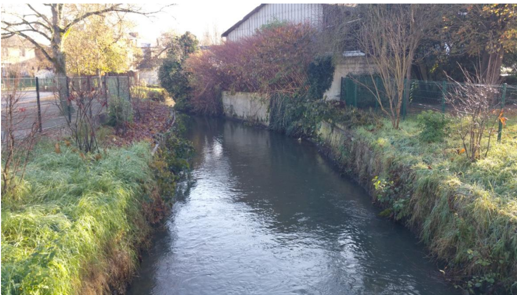
Bords de l'Yvette